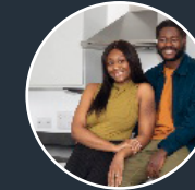
Moat at Culverley Gardens A new year and fresh start at Culverley Gardens

We use case studies for publicity in relevant housing magazines, for press releases and occasionally on our website. If you are willing to participate, please let us know on the declaration form (See Page 2) and we will contact you.