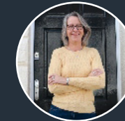
Moat Homes Staircasing with Moat Homes